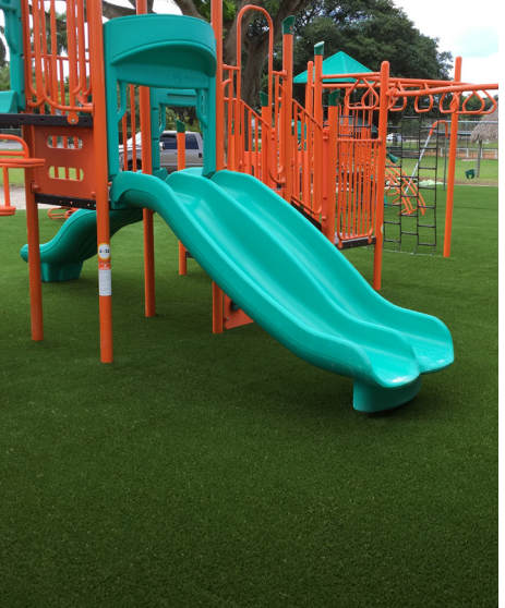
The Finishing Touches on Your New Investment